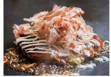
Seijuro Special Okonomiyaki

清十郎スペシャルお好み焼き Pork, Shrimp, Dried Shrimp, Octopus, Spear Squid, Fried Fat