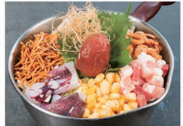
Plum Mix Monjayaki

Plum, Shiso Leaf, Squid, Dried Shrimp, Pork, Baby Star Noodles, Corn