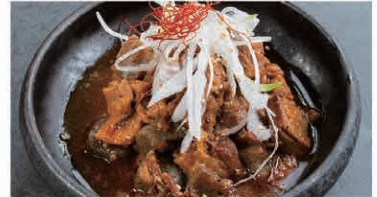
Wagyu Beef Tendon & Konjac Stew