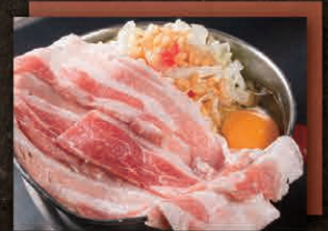
Carefully Selected Premium Ingredients.

Our Homemade Sauce, with a Perfect Blend of Sweetness, Richness, Tanginess, and Spice, Elevates Every Pancake.