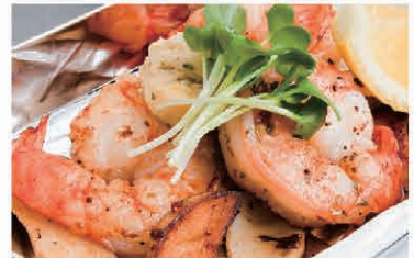
Garlic Butter Shrimp