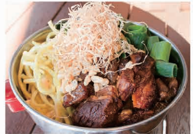
Beef Tendon and Konjac Monjayaki

Shrimp, Dried Shrimp, Squid, Octopus, Baby Star Noodles