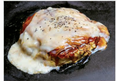
Mochi Cheese Okonomiyaki