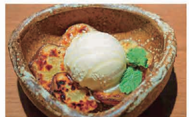
Grilled Sweet Potato with Maple Butter+Vanilla Ice Cream