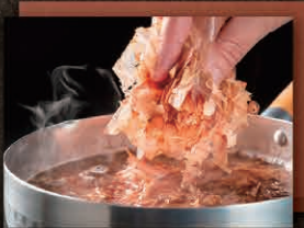
An Exceptional Umami Crafted by Rich Dashi.

A Special Dashi Made with Rich Broth from Simmered Bone-In Chicken, Blended with the Finest Sodabushi Dashi.