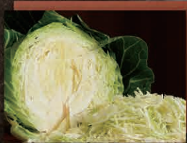
Hand-Cut Cabbage from Local Farms.

A Special Dashi Made with Rich Broth from Simmered Bone-In Chicken, Blended with the Finest Sodabushi Dashi.