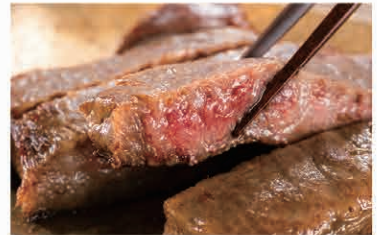
Wagyu Sirloin Steak