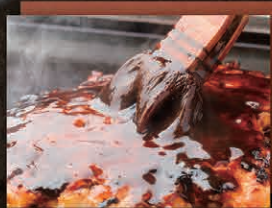
A Unique Blend That Creates a Deep, Rich Flavor.

Cabbage Delivered Fresh from Contract Farms, Carefully Hand-Cut to Bring Out Its Natural Sweetness.