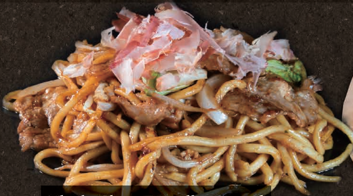
Thick, Chewy Noodles Coated with Our Rich, Special Sauce.

Featuring Premium Meats, Fresh Local Seafood, and Sweet, Flavorful Vegetables to Create a Luxurious Taste.