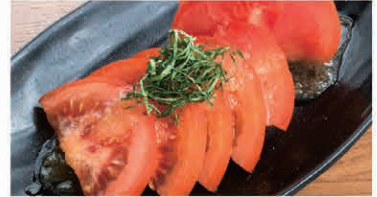
Whole Tomato Salad