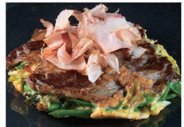
Green Onion Pancake with Beef Tendon and Konjac