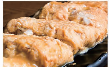
Dashi Rolled Omelette