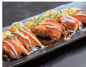
Tonpei-yaki (Pork Omelette)