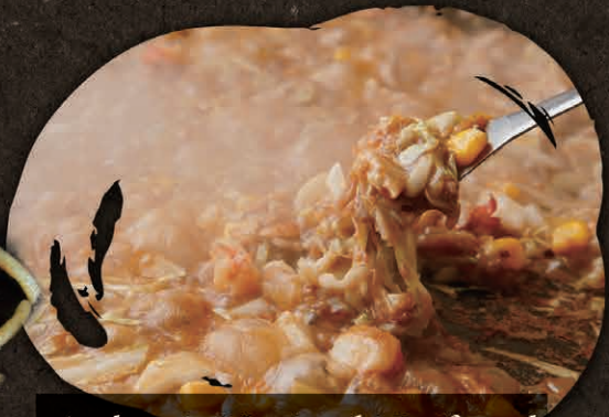
Authentic Monjayaki Perfected with Kansai-Style Dashi.

Our Custom-Made Thick Noodles are Coated with a Special Sauce Blended with Various Spices. Grilled on the Teppan, It Brings Out a Smoky Aroma and a Rich Umami That Deepens with Every Bite.