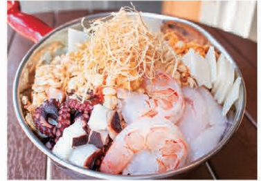
Seafood Mix Monjayaki