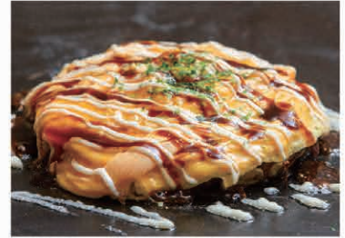
Pork Okonomiyaki with Omelette